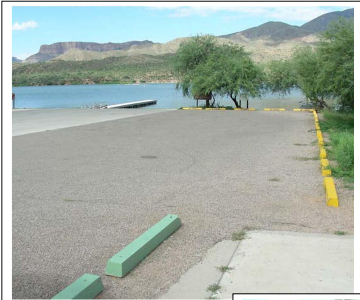
Burnt Corral site near launch parking